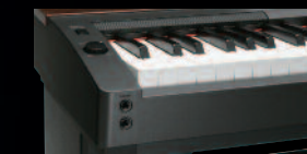
Two standard front-panel headphone jacks